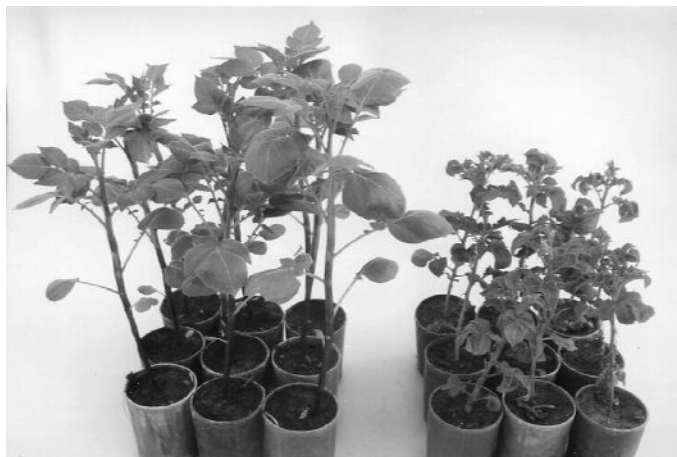
Fig. 1 The samples of three resistant to PVM parental lines (left), no disease symptoms and three susceptible cultivars (right), severe mosaic, malformation of leaves and dwarfing of secondary infected plants are visible

Severity of symptoms was estimated on daughter tuber progeny of plants infected with severe strain of PVM (Zagórska et al. 2000). Potato cultivars and breeding clones could react with malformation of leaves and dwarfing of plants (Fig. 1). Plants of 28 cultivars out of 76 tested showed mild symptoms independently on virus strain, plants of 12 cultivars did react with very severe symptoms after infection with severe strain of PVM. Plants of other 36 cultivars expressed variable reaction, sometimes with severe symptoms (Table 1).