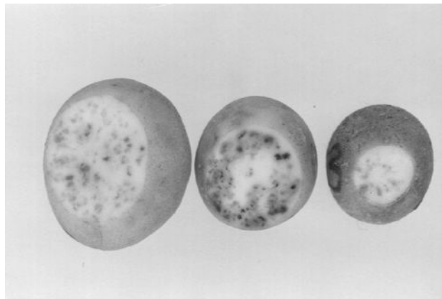
Fig. 3 Potato tubers collected from grafted plants of three resistant parental lines carrying the gene Rm – numerous necrotic spots in flesh are distinct