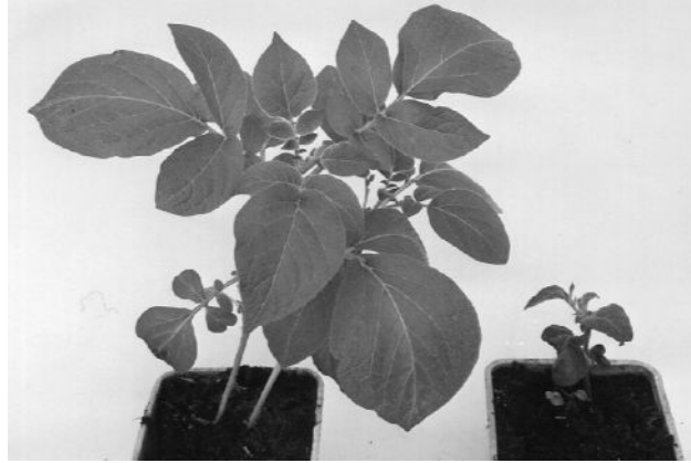
Fig. 4 The healthy potato plant (left) and the plant grown from the tuber showing necroses (right). This type of symptoms is characteristic for the hypersensitive reaction of plant to PVM

candidate cultivar and 28 advanced breeding clones were tested in 2000 in official trials (Table 4).